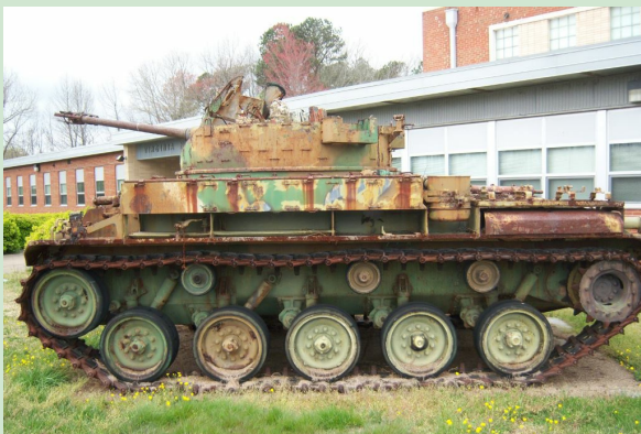
The M-42 Duster (twin 40mm) was a key